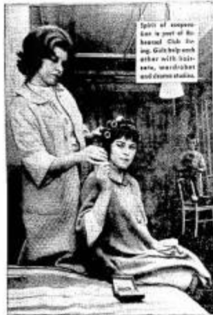
Spirit of cooperation has in part of Rehearsal Club. Girls help each other with hair, make-up and dress styling.