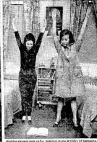
Aspiring actresses team up for exercises in one of Club's 10 bedrooms.