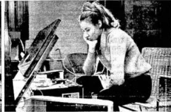
Youthful self-reliance is the mark of maturity in an actress. Rehearsal Club's tape recorder gets actress heavy work.