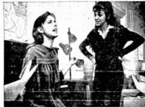
Drama grants is part of life at Rehearsal Club. Aspiring actresses audition for each other.