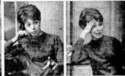
Agent talks with her first big opportunity. She can't believe it really happened.