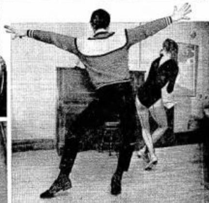
Perfecting dance routines, recitals and her former practice in Club's rehearsal room.

More than 10,000 starry-eyed young actresses have lived in the club since it was founded in 1913. A few have gone on to stardom, some have achieved a small measure of show business success, many more have not. But each of the girls living there now is sure her name will someday be so on a theater marquee in lights—just like Carol Burnett's.