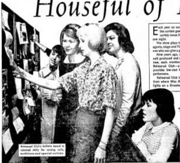
Rehearsal Club's bulletin board is checked daily for casting calls, auditions and special notices.

Each year on some small off-Broadway stage, the curtain goes up on a diligently-rehearsed variety revue that is destined to run for only one night.