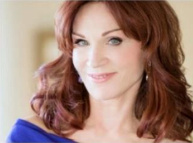
HOSTED BY MARILU HENNER